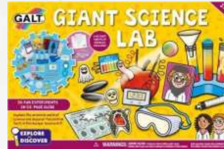
BOX OF SCIENCE